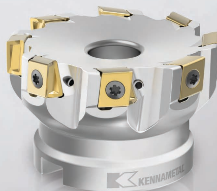
Mill 4™-12 KT

Kennametal's Mill 4-12 KT requires up to 15% less horsepower, enabling increased feed rates even on 40 taper machines. Its proprietary insert design features a triangular shaped margin that provides unprecedented stability in steel and cast-iron applications and its minimal axial runout delivers excellent floor finish. With seven grades, seven corner radii and a depth-of-cut range up to .472" (12mm), the Mill 4-12 KT can bring new versatility to your shoulder milling applications.